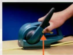
Yellow power button

4 Turn the tighten ratchet clockwise to tighten the strap. Hold the tighten ratchet with your whole hand. Press on the tighten ratchet rubber handle with your thumb. Press the tension ratchet hard to get extra tension. Tension varies depend on users' arm force output.