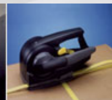
Corrugated box strapping