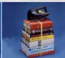
Bulk article strapping