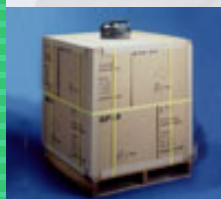
Light weight pallet strapping